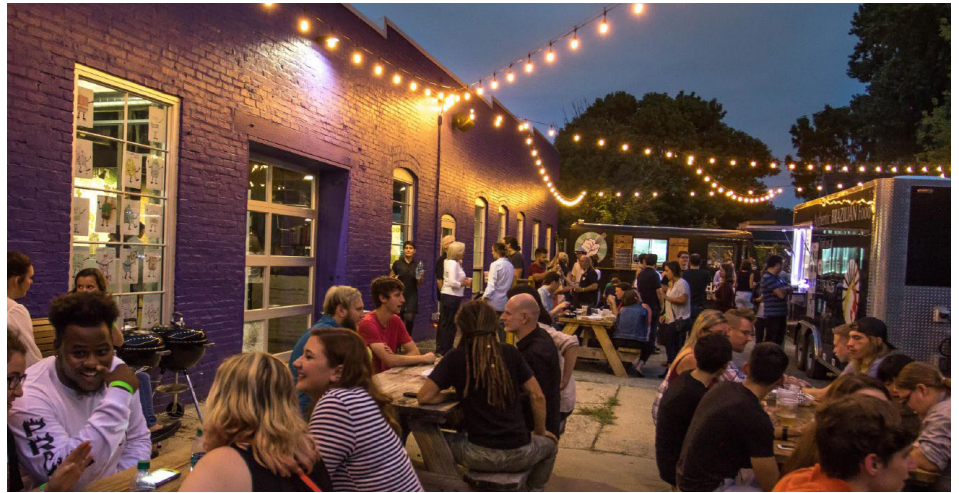
People gathering at Big Car's Tube Factory artspace in Indianapolis

B ig Car Collaborative is a flexible and adaptable nonprofit art and design organization and collective based in Indianapolis, Indiana. We facilitate people-focused placemaking and socially engaged art projects and programs in support of thoughtful and creative community development.