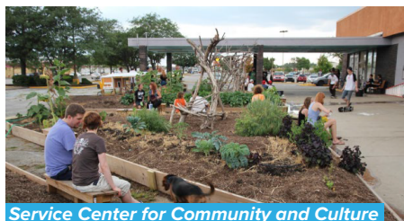
Service Center for Community and Culture