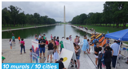
10 murals / 10 cities